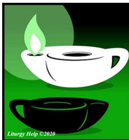
Liturgy Help ©2020

Our Parish Churches are both registered Covid-19 Safe places of worship .