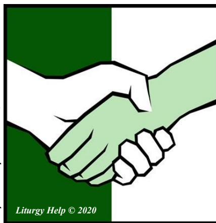
Liturgy Help © 2020