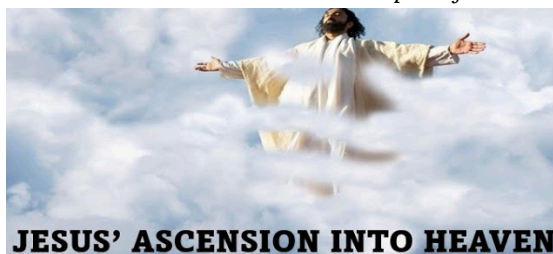
JESUS' ASCENSION INTO HEAVEN