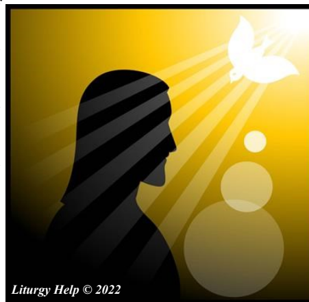
Liturgy Help © 2022

Catholics from the Diocese of Lismore are dispensed from their Sunday Mass obligation until further notice.