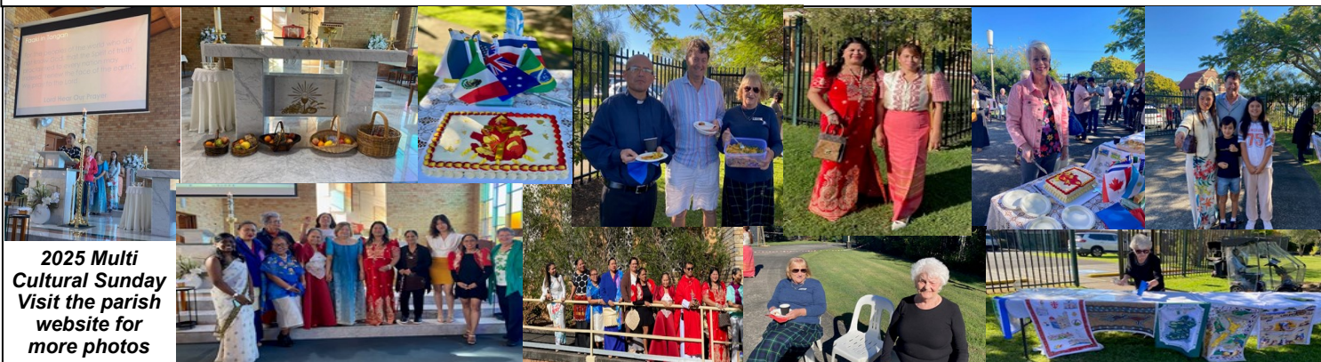
2025 Multi Cultural Sunday Visit the parish website for more photos