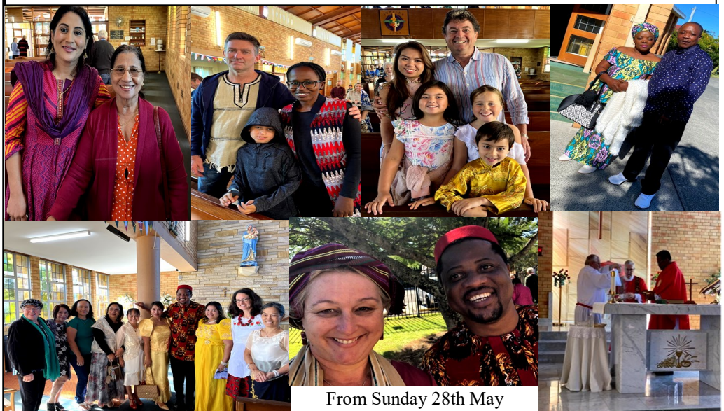
From Sunday 28th May