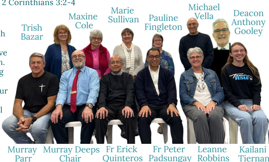
Parish Pastoral Council Members

We are pleased to share that the Parish Pastoral Council has been meeting bi-monthly to develop a comprehensive Two-Year Strategic Plan for our parish. This initiative builds upon our ongoing vision work and aims to provide clear priorities and a shared direction for our community as we move forward together in faith. Rooted in the Gospel and guided by the Holy Spirit, the Strategic Plan will focus on key areas such as spiritual growth, liturgical life, outreach and service, youth engagement, and stewardship.