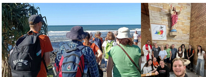
Pilgrims of Hope