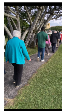
Eucharistic Procession June 2026