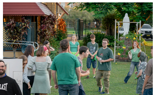
Celebrating St Patricks Day